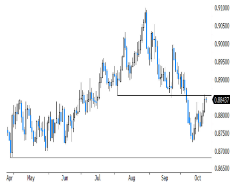
EUR/GBP: sterling again slightly more vulnerable to Brexit noise