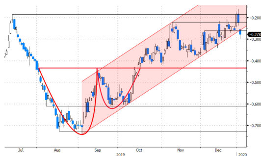
German 10-yr yield: Q4 uptrend about to end because of geopolitical stress?

Technically: the German 10-yr yield failed to take out the July high (-0.19%), causing rebound action lower. The geopolitical safe haven bid could end the Q4 upleg. Key support stands around -0.40%. The US 10-yr yield on several occasions failed to move north of 1.94%. A return lower in the 1.42%-1.94% trading can be expected. First minor support stands at 1.66%/1.69%.