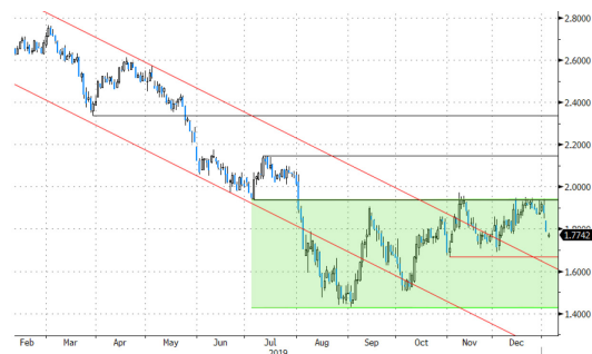
US 10-yr yield: Failure to take out 1.94% resistance suggests short term return action lower.