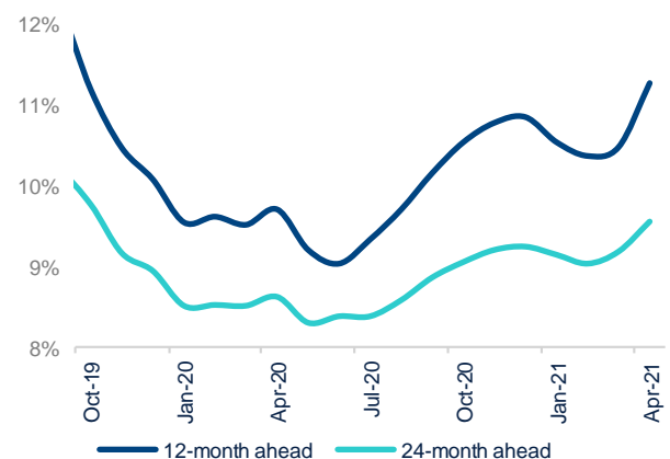
Chart 2. 12-Month and 24-Month Ahead Inflation Expectations (%)